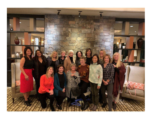
PWGA Closing Dinner